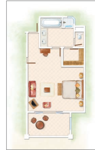
Deluxe Room / Deluxe Ground Floor