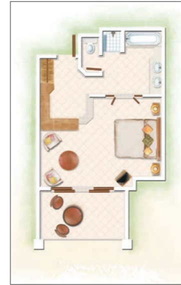
Tropical Room / Tropical ground floor