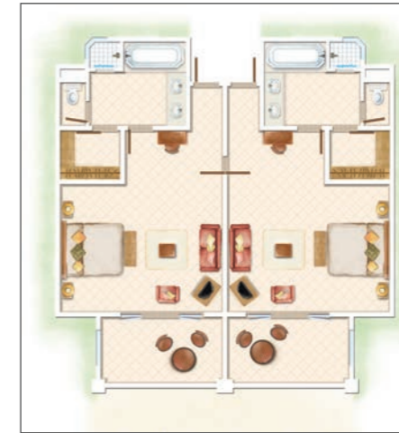
2-Bedroom Deluxe Family Apartment (2 interleading rooms)