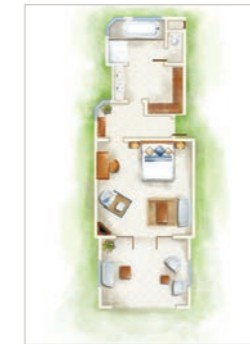
Junior Suite / Junior Suite Beachfront