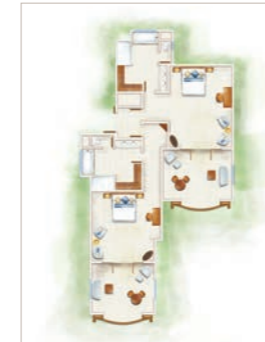
2-bedroom family suite / 2-bedroom Family Suite Beachfront