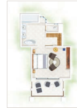
Paradis Bay View