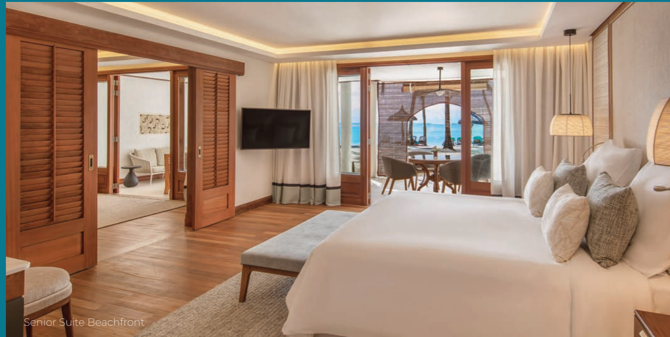
Senior Suite Beachfront