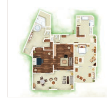
2-bedroom Senior Family Suite Beachfront