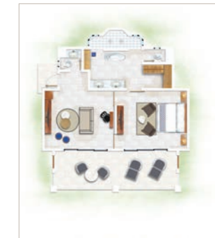
Paradis Suite Beachfront