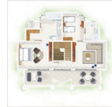
Paradis Luxury Family Suite Beachfront