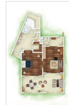
Senior Suite Beachfront