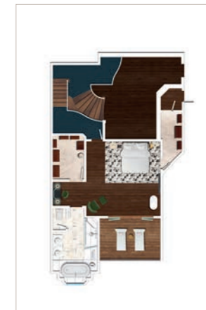
Royal Villa - First Floor