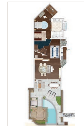
Royal Villa - Ground Floor