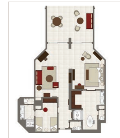
Palm Suite Family