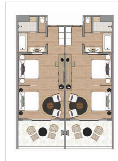
2-Bedroom Deluxe Family Apartment Ground Floor (2 interleading rooms)