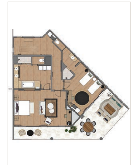
2-Bedroom Family Apartment (ground floor, first floor & second floor)