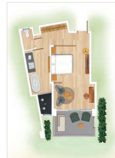
VICTORIA FOR 2 Ocean View Room