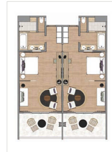
2-Bedroom Superior Family Apartment (2 interleading rooms - first floor)