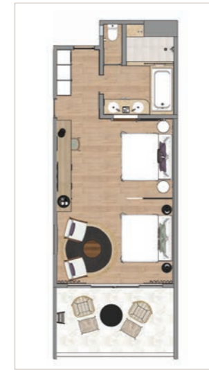
Deluxe Ground Floor