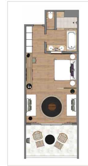
Deluxe room (second floor)