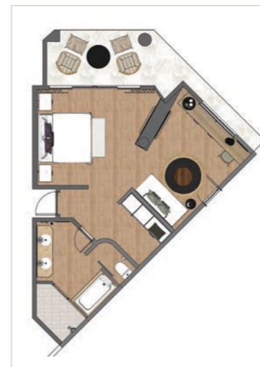
Junior Suite (ground floor)