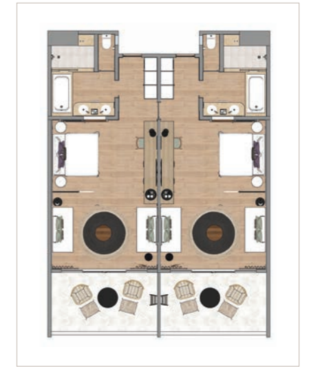
2-Bedroom Deluxe Family Apartment (2 interleading rooms - second floor)