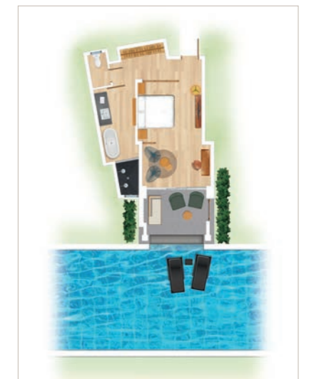
VICTORIA FOR 2 Swim-up room