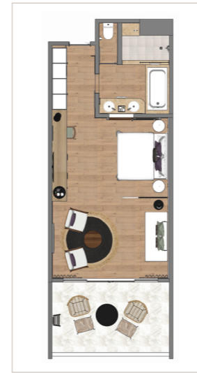
Superior Room First Floor