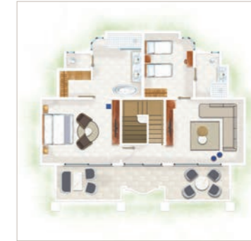
Paradis Luxury Family Suite Beachfront