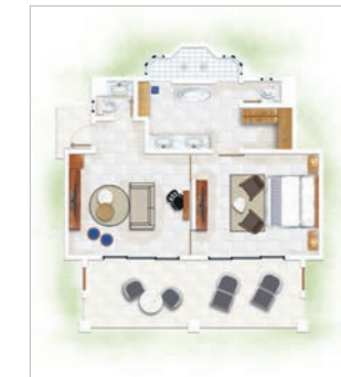
Paradis Suite Beachfront