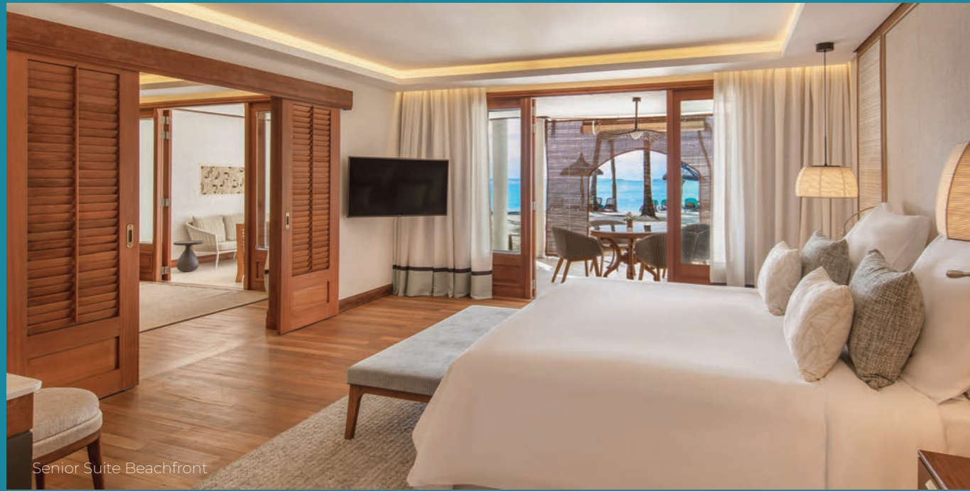
Senior Suite Beachfront