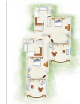
2-bedroom family suite / 2-bedroom Family Suite Beachfront