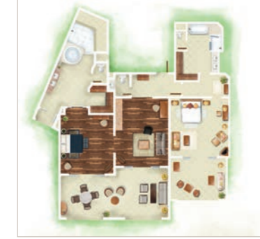
2-bedroom Senior Family Suite Beachfront