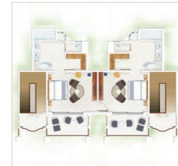
2-bedroom Paradis Family Suite Beachfront (2 interleading rooms)