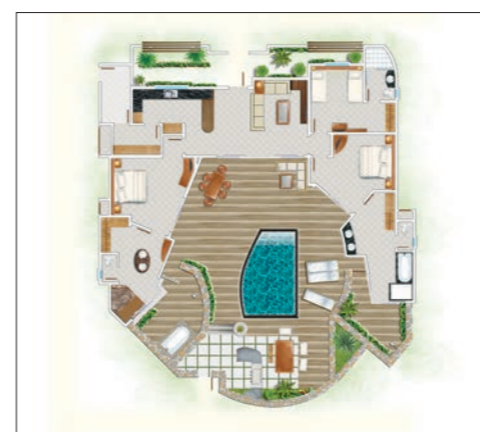
3-Bedroom Pool Villa