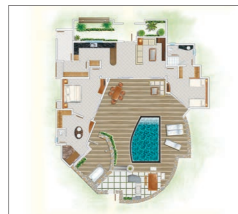
2-Bedroom Pool Villa