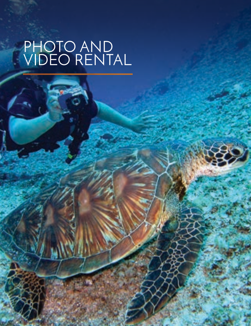
PHOTO AND VIDEO RENTAL

Rent our digital photo camera or Go Pro video camera to capture treasured moments. Take all of the oceans good memories home with you in stunning high definition!