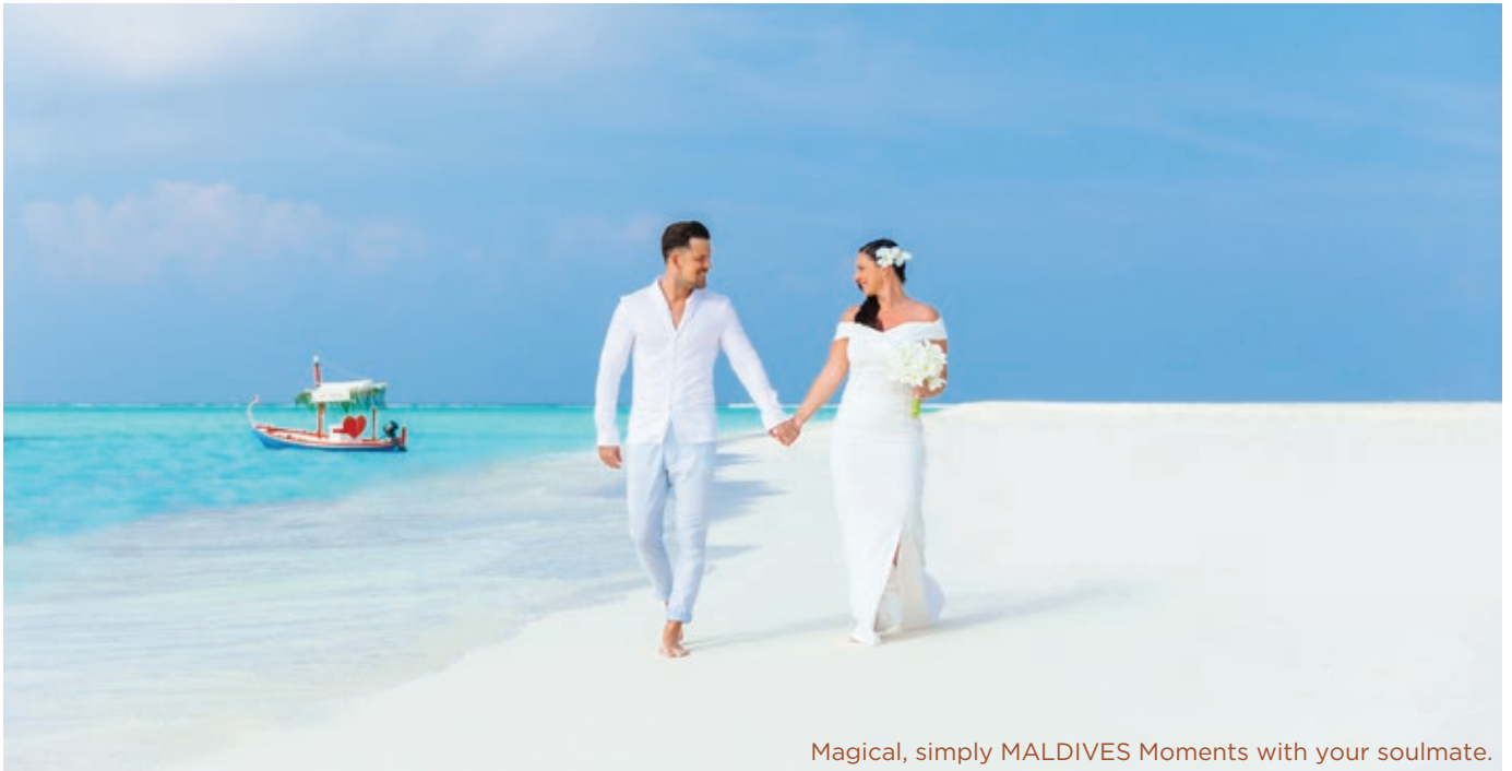
Magical, simply MALDIVES Moments with your soulmate.