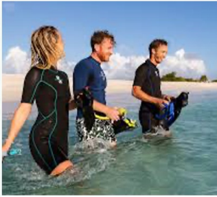
Group Snorkeling Lesson 30mins USD35++