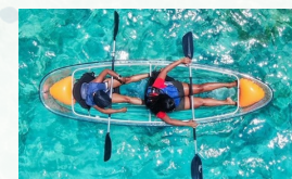
GLASS KAYAK 30minutes USD20++