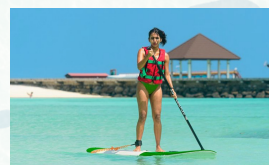
STAND UP PADDLE 1HR USD10++