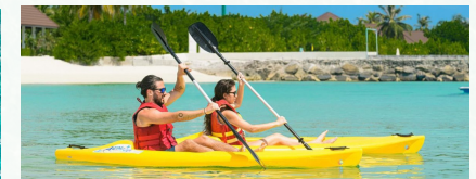
DOUBLE KAYAK - 1HR USD20++ SINGLE KAYAK - 1HR USD15++