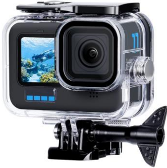
GOPRO $50++ PER TRIP