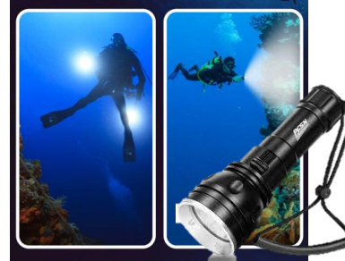
DIVE TORCHES $25++ PER PERSON PER TRIP